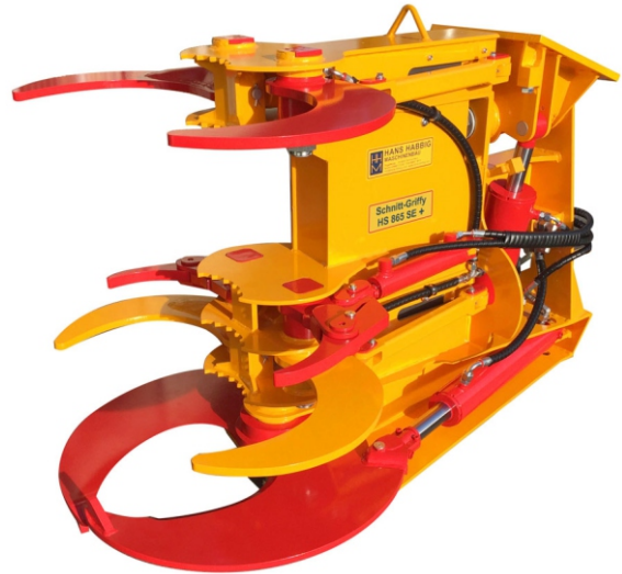
Schnitt-Griffy HS 865 SE+