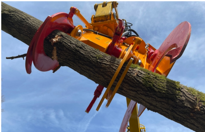
Schnitt-Griffy HS 865 SE+ in gripper mode