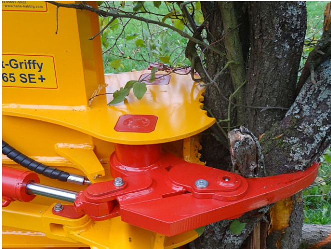
Schnitt-Griffy HS 865 SE+ in action