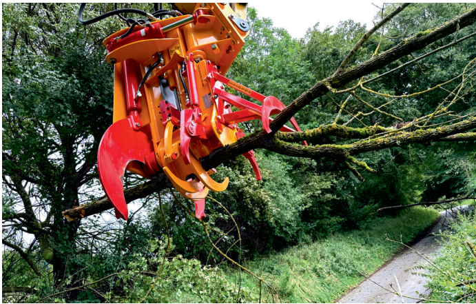
Schnitt-Griffy HS 800 SE with SG 800 in gripper mode