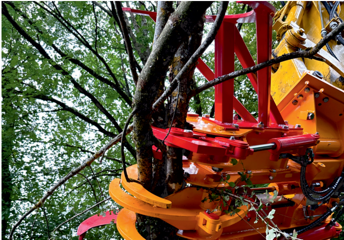
Schnitt-Griffy HS 800 SE with SG 800 in action