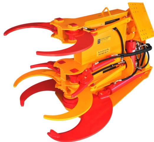
Schnitt-Griffy HS 960 SE+