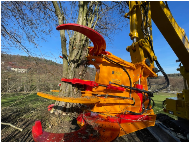
Schnitt-Griffy HS 960 SE+ in action