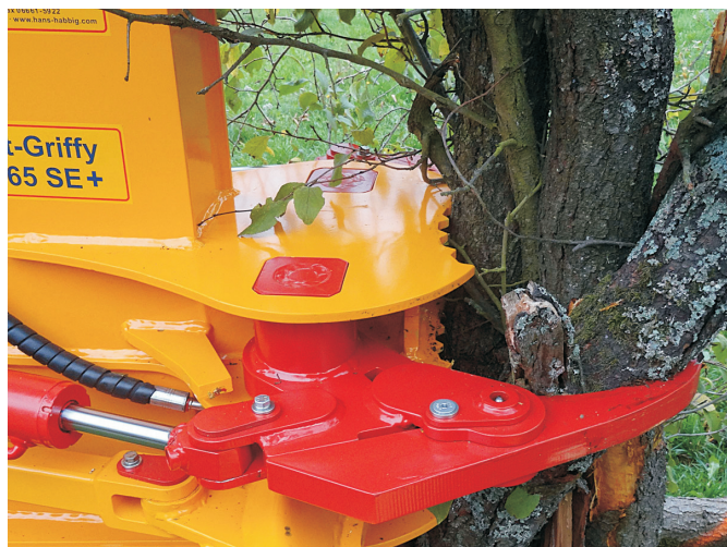
Schnitt-Griffy HS 865 SE + in action